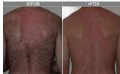
Hair Reduction after 5 Laser Treatments