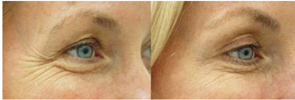
Before After BOTOX injection

BOTOX®: We use BOTOX® Cosmetic injections for dynamic wrinkle reduction and hyperhidrosis (excessive underarm sweating).